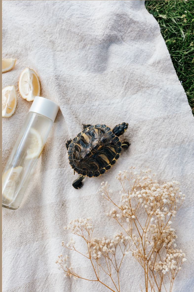
STEP 2: ADJUST EXPOSURE