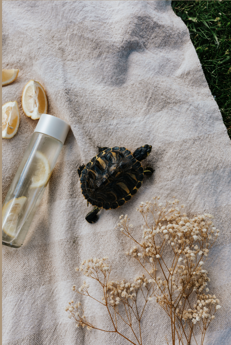
STEP 1: APPLY PRESET